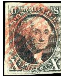
1847 US Scott #2.

At first their goal was to find any stamp that cost a nickel, then ones priced at a dime. Eventually stamp collecting mania took hold, and the search was on to find those missing spaces. Stamp dealers in Syria were contacted to find obscure stamps that their US counterparts didn't have in their holdings. By the summer of 1976 the duo were just down to 28 stamps. The last stamp to find a place in the album was a Malaya Kelantan #10 overprint, found at Union Philatelic in New York City. Thus the collection was complete-all 195,219 stamps. The most expensive stamp in the collection was valued in the 1971 edition of the Scott Catalog for $750. If one would try the same feat in 2011 one of the more expensive stamps is US Scott #2 that catalogs $1,200 for a used specimen.