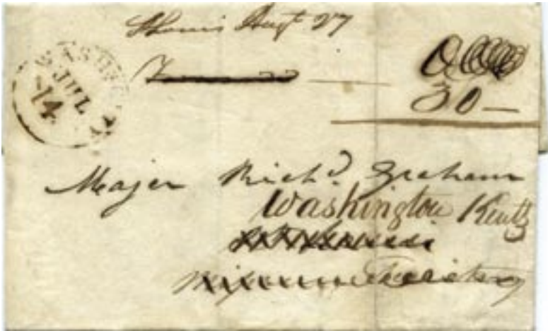
Figure 4: Letter written by George Graham datelined Washington City July 13, 1815 postmarked “WASHN. CITY JUL 14” and rated 37 1 / 2 cents due (25 cents for distance over 500 miles plus 50% war surcharge) to Major Richard Graham, St. Louis, Missouri Territory. The postage was paid and the letter remained with postmark “St. Louis Augt. 27” to Washington, Kentucky, and rated 30 cents (20 cents for distance 300 to 500 miles plus 50%). The crossing out of “Forwarded” implies the letter was first taken out of the mail before remaining.

After the War of 1812 the postal rates were raised 50% for over a year. The cover in Figure 4 demonstrates these rates on a rare territorial forwarded use.