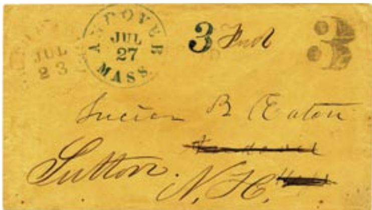
Figure 11: Post-1855 cover addressed to Lucien B. Eaton in Andover, Mass. Mailed July 23 from South Hadley with 3 handstamps in a pale ink: the circular date stamp "SOUTH HADLEY Mass. JUL 23" "PAID" and a "3". At Andover, the forwarding information of Sutton N.H. was added along with manuscript "Fwd" and blue cds "ANDOVER MASS JUL 27" and blue "3" for the postage due.

In 1855 the rate was changed to just three cents and all postage had to be prepaid. But forwarded letters often still incurred unpaid postage to be collected from the addressee (see Figure 11). This was an issue with Civil War soldiers so legislation was enacted to allow soldiers' letters to be forwarded free. Letters from the soldiers still had to pay additional postage. 6