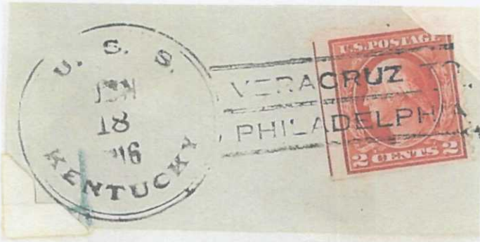
Figure 7: A cutting of a KENTUCKY cancellation of 18 June 1916 with the notation Veracruz-Philadelphia between the killer bars. KENTUCKY departed Vera Cruz on 2 June 1916 and arrived back at the Philadelphia Navy Yard on 18 June 1916. One can assume this cancellation was prepared for first day service at Philadelphia. Since this cancellation mark differs greatly from that used to service the other cancellations in this article, one wonders if it was supplied to Kentucky by an early cover collector upon arrival in Philadelphia.