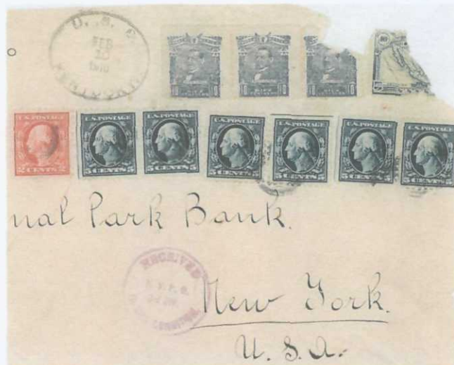
Figure 5: Unfortunately someone in the past cut down this envelope, removing the return address and part of the delivery address ("nal Park Bank, New York, USA") plus the rear section, leaving only the stamps and KENTUCKY'S cancellation. The envelope is franked with four Mexico Correos stamps, three of 10 Centavos and one of 40 Centavos. It also carries $.32 in U.S. postage, consisting of one $.02 stamp and six $.05 stamps. The envelope, as noted, is addressed to a bank in New York City and was serviced on board KENTUCKY on 10 February 1915. It carries an auxiliary marking stating, "Received In Bad Condition, N.Y.P.O. 3 rd Div." Perhaps one of our members can identify the bank.