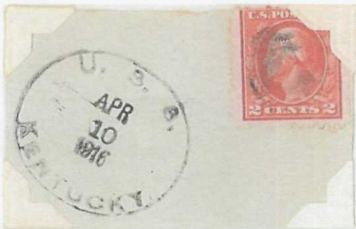
Figure 8: A cutting of a KENTUCKY cancellation dated 10 April 1916 during the period she was operating off the east coast of Mexico.

During World War I, KENTUCKY served as a training ship in the Chesapeake Bay area. In 1919, she conducted a midshipman cruise to the Caribbean Sea. In 1920, KENTUCKY was laid up at the Philadelphia Navy Yard, and in 1924, she was sold for scrap to Dravo Construction Company.