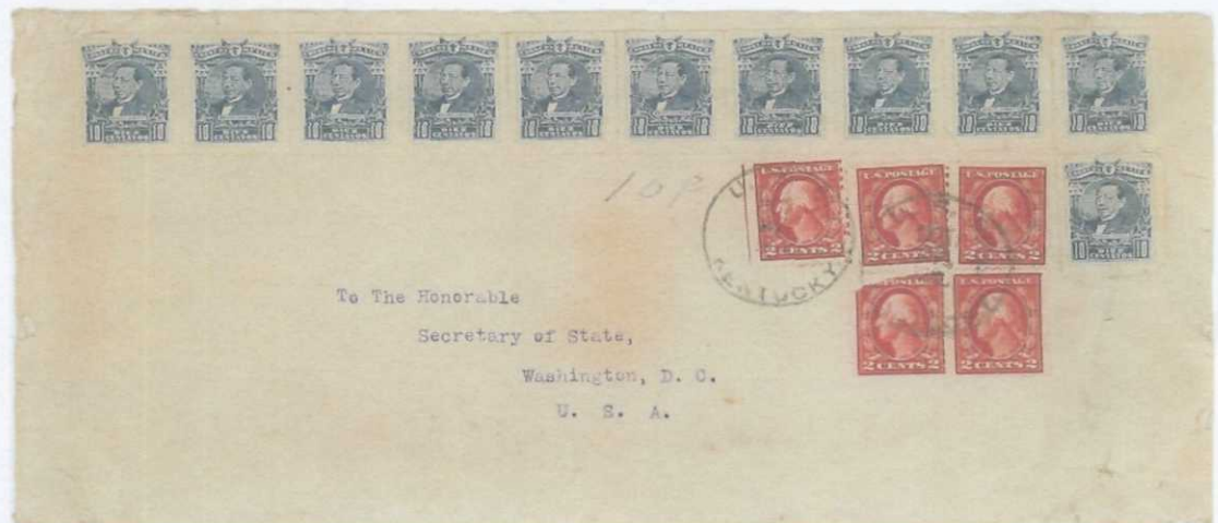
Figure 1: A legal envelope mailed on 11 October 1915 in Mexico City and serviced on board KENTUCKY on 27 October 1915. The cover carries eleven uncancelled Mexico Correos 10 Centavos stamps and five cancelled $0.02 United States postal stamps. The letter is addressed to the United States Secretary of State Robert Lansing, but unfortunately, there is no return address to tell who the sender was. Was someone trying to communicate some matter of public or private importance to the Secretary of State?

KENTUCKY sailed from the Philadelphia Navy Yard for Vera Cruz, Mexico, on 11 September 1915 and reached that port on 28 September 1915. She would remain at Vera Cruz until 2 June 1916 except for some rest and recreation at New Orleans during that city's March 1917 Mardi Gras celebration. During KENTUCKY's stay at Vera Cruz, she processed not only her own mail but forwarded mail originating in Mexico destined for a foreign address. The following covers and postal cancellations are from a private museum devoted to commemorating ships named KENTUCKY.