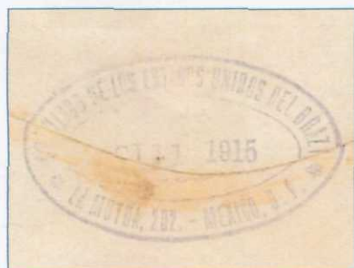
Figure 2: Reverse of cover from Figure 1 showing 11 October 1915 mailing date.